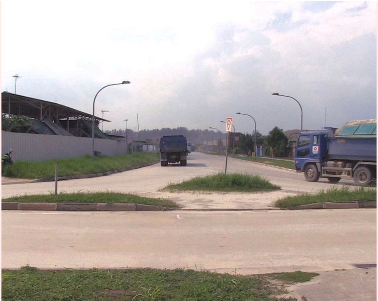
SAND Images of Territory