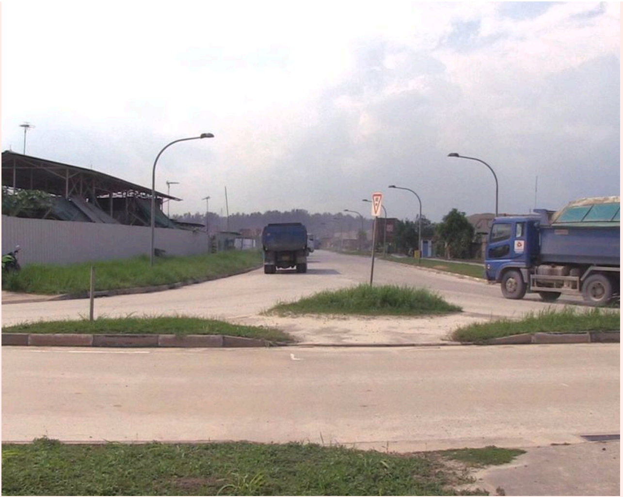
SAND Images of Territory