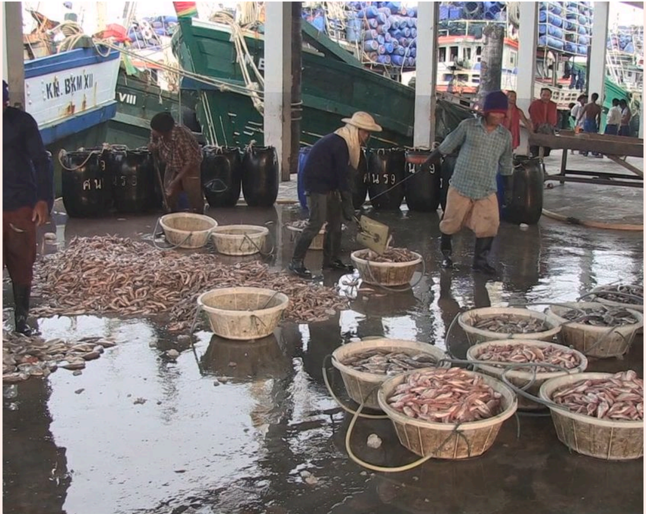
FOOD Images of Territory