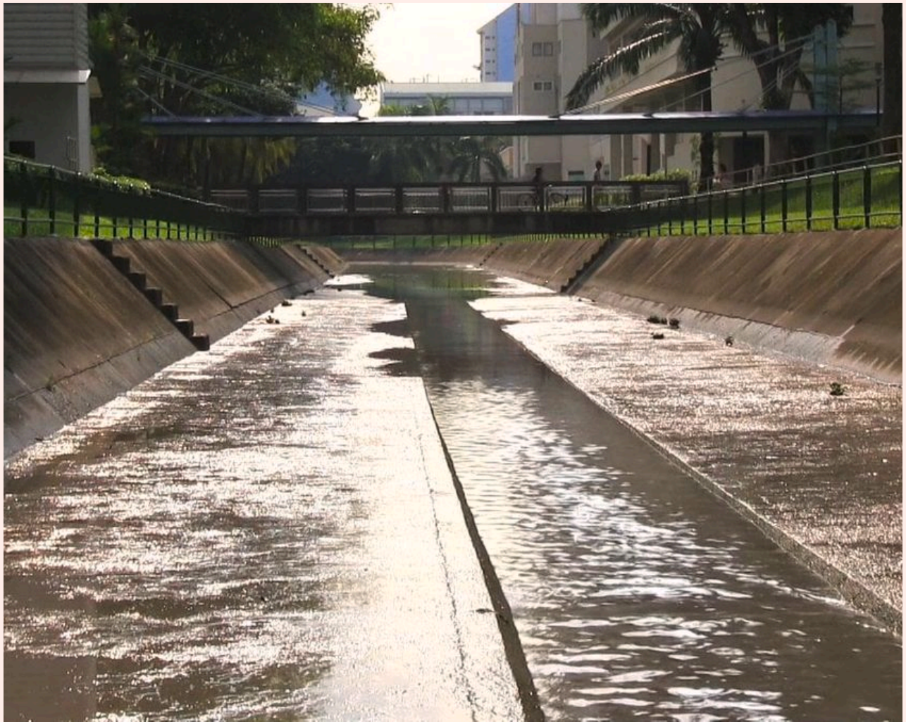
WATER Images of Territory