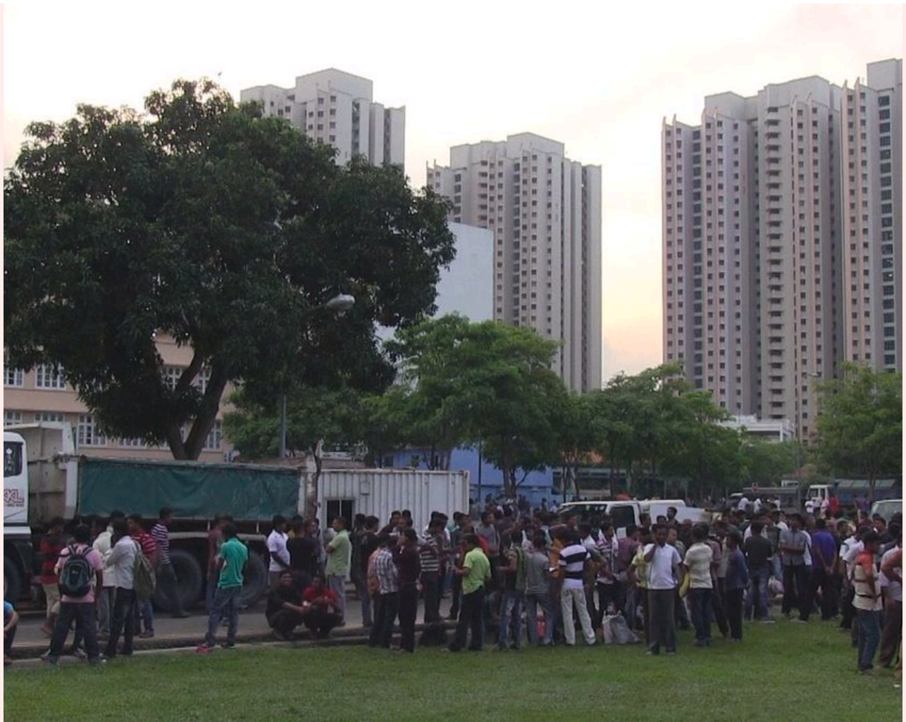
LABOUR Images of Territory